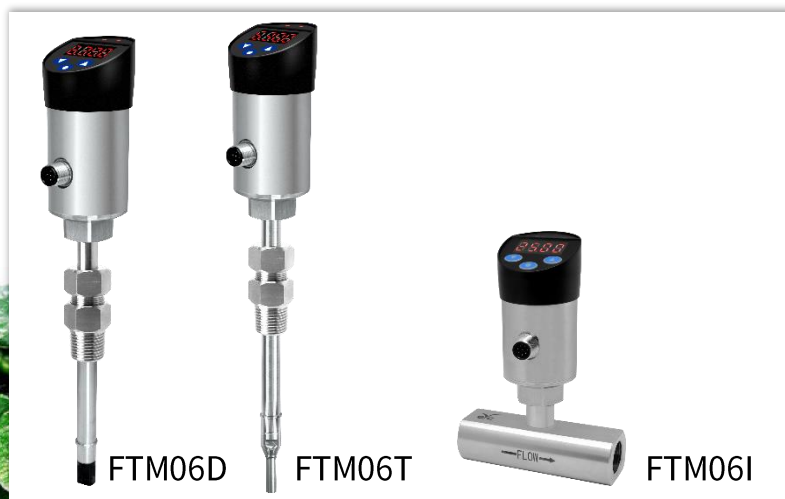
eYc FTM06 Series

FTM06 Series Air / Water Thermal Mass Type Velocity Flow Transmitter (Insert / Pipeline type)